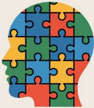
World Autism Awareness Day